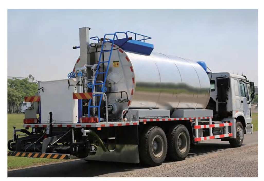
Asphalt Distributor in Philippines