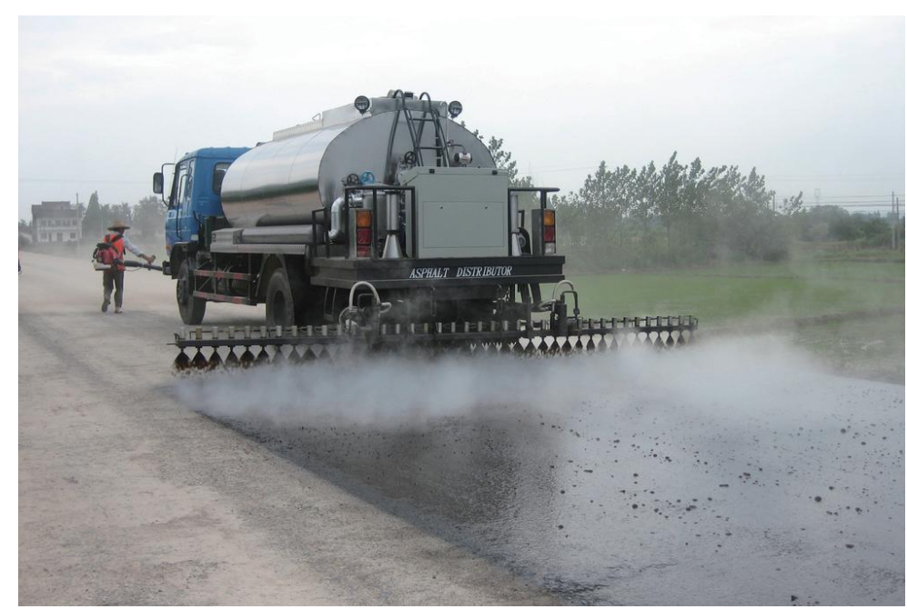
Automatic Bitumen Sprayer in Australia