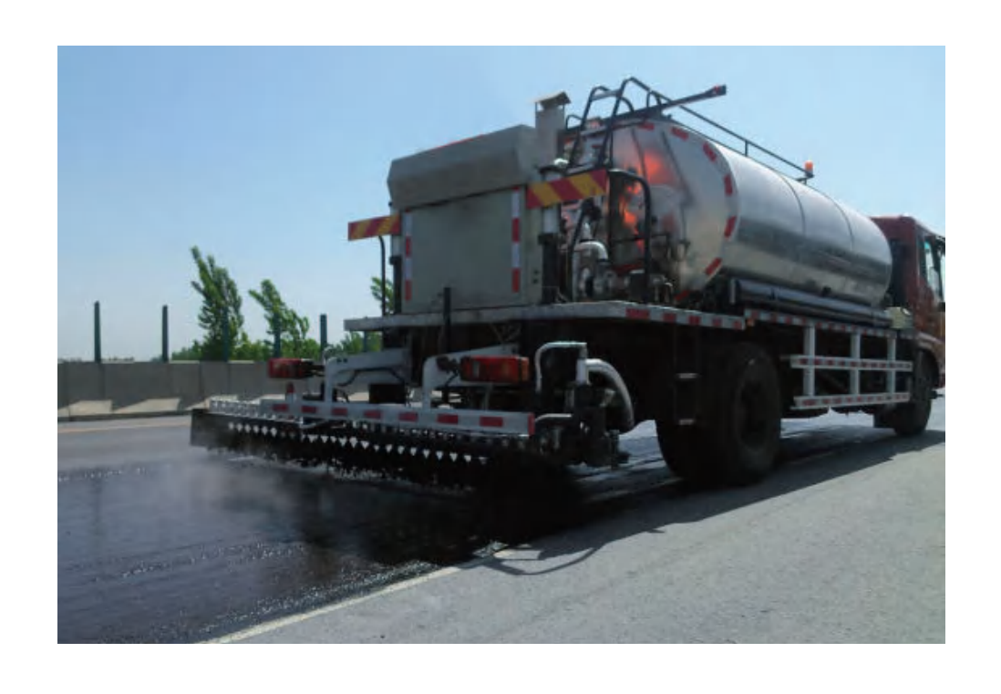
Automatic Bitumen Sprayer in Africa