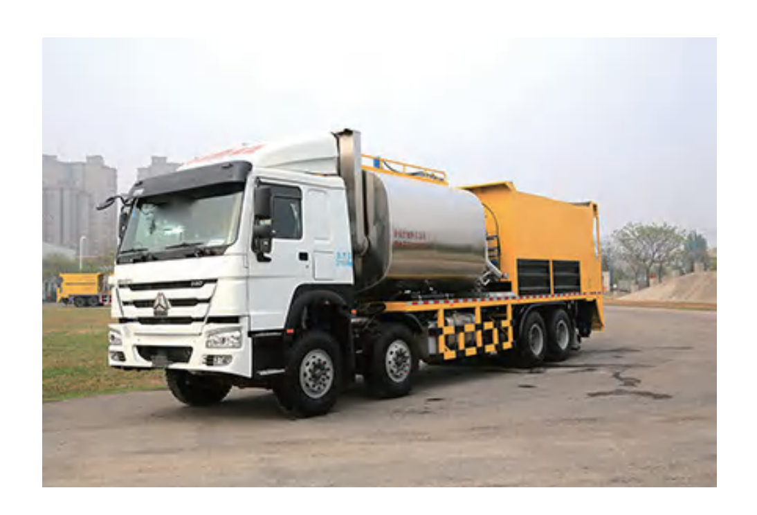
Synchronous Chip Sealer in Ethiopia