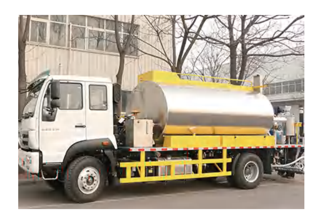
Asphalt Distributor in Thailand