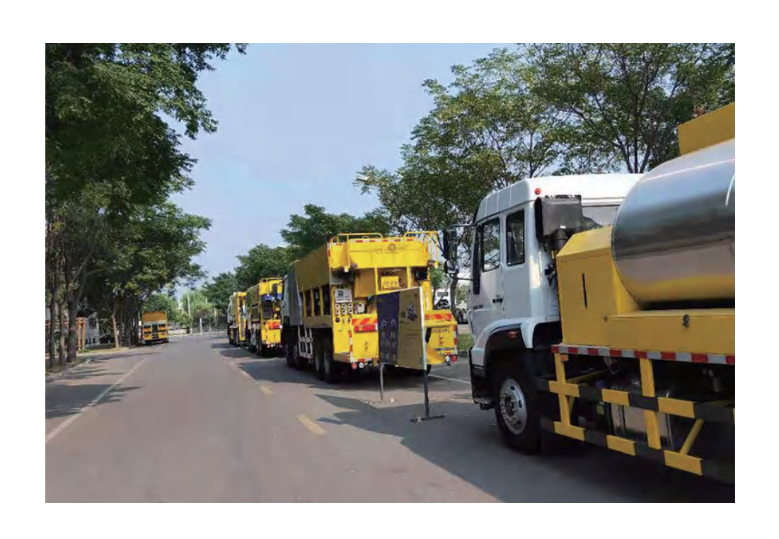
Asphalt Distributor in uzbekistan