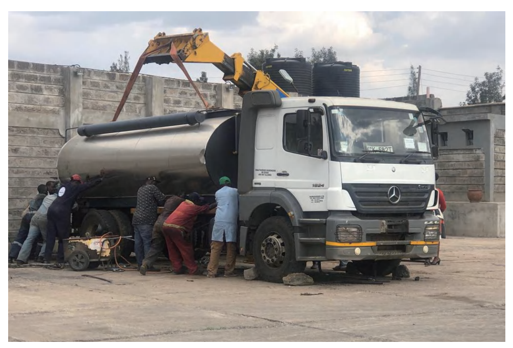
Asphalt Distributor in Nigeria