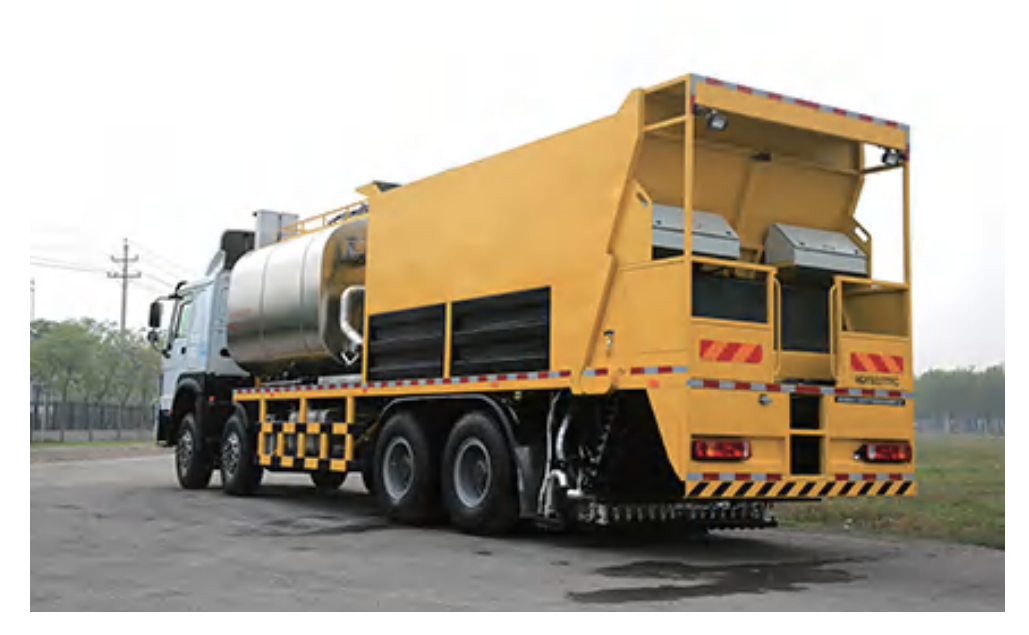
Synchronous Chip Sealer in Peru